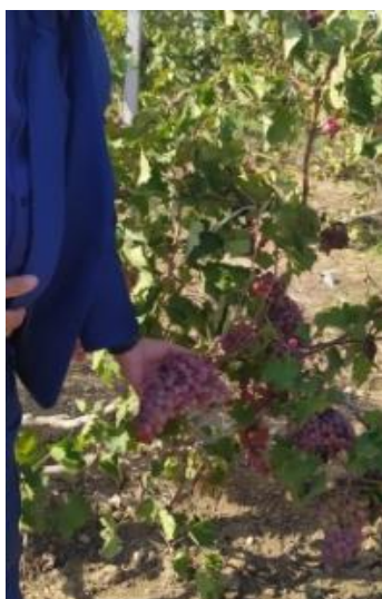
Fig. 3. Grapes stored on the vine (late October)

Results and discussions. The mass harvest of the grapes grown in the Institute's vineyard was completed in the first half of September; to check the suitability of the grapes for storage on the vine, some batches of the varieties studied were left on the plant until the second half of November when the precipitations increased; at the same time, regular checks were made on the appearance of the grapes and their biochemical composition was studied. (Fig. 3, Table 1).